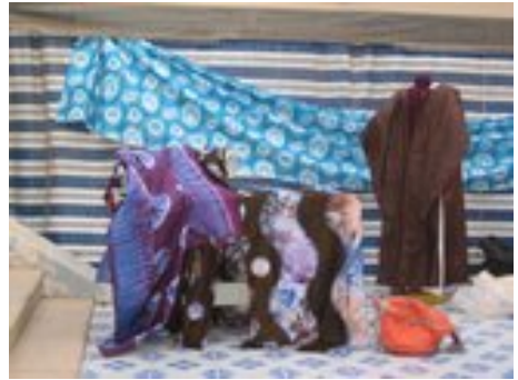
Figure 1 A textile display