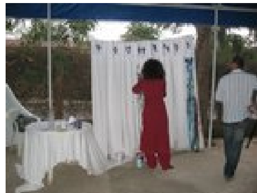
Painting in progress, inspired by N'ko characters